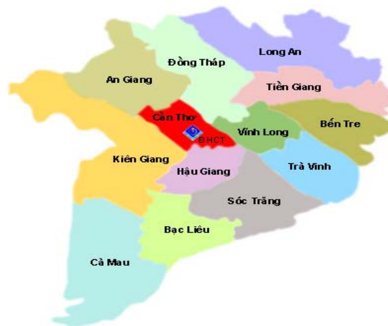
Red River Delta map

The southern provinces try to finish seeding summer-autumn rice by the end of June. Up to now, most southern provinces have seeded substantial areas for the summer-autumn crop. In Quang Ngai, 27,745 hectares of summer-autumn rice were seeded. The local people expect a yield of about 5.5 tons per hectare. Thanks to favorable weather and abundant rain, Tien Giang province farmers seeded summer-autumn rice at the right time on 72,630 hectares; the average yield is expected to be 4.38 tons per hectare and estimated rice production to be 317,766 tons. At the same time, Can Tho has finished seeding rice on about 84,000 hectares. Of this, 75,000 hectares (89.2%) are seeded to high-quality rice varieties that meet export standards.